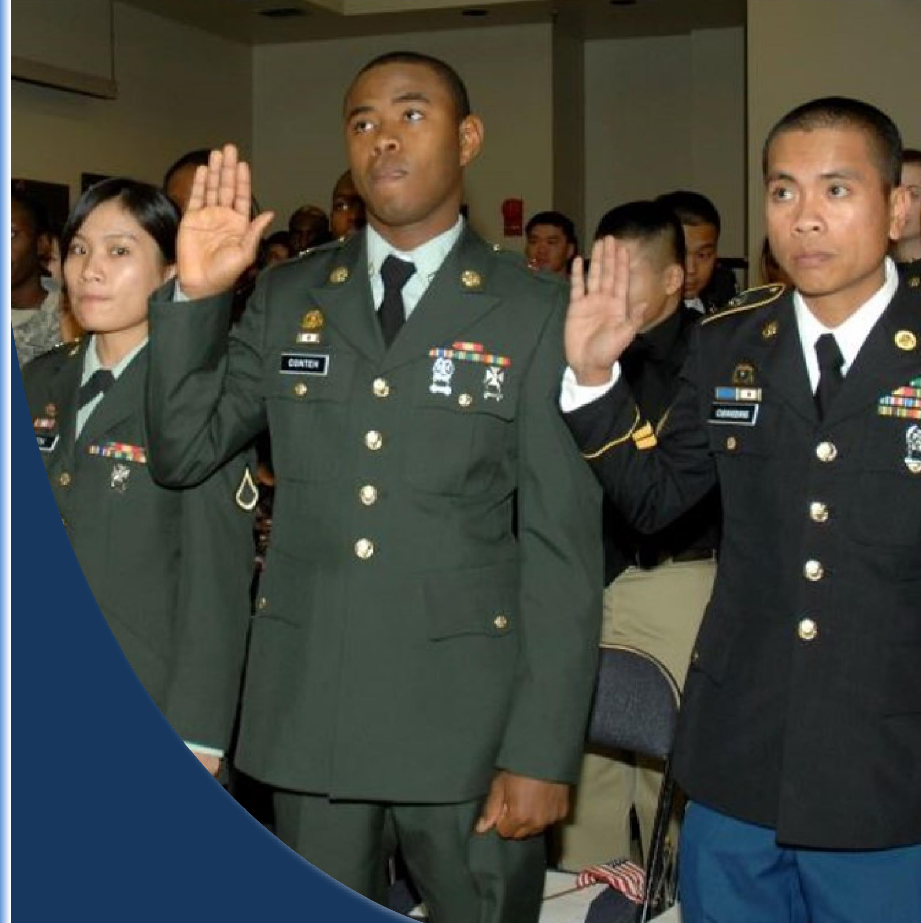
Military Naturalization Ceremony - Yongsan Korea - 15 December 2008 - USFK - United States Army - USAG-Y