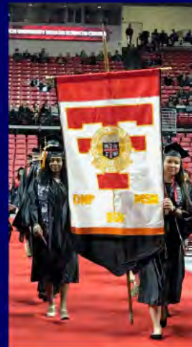
Commencement Banner Bearer